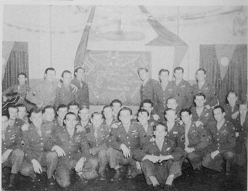
Right: Party at Thirty-Mission Haven