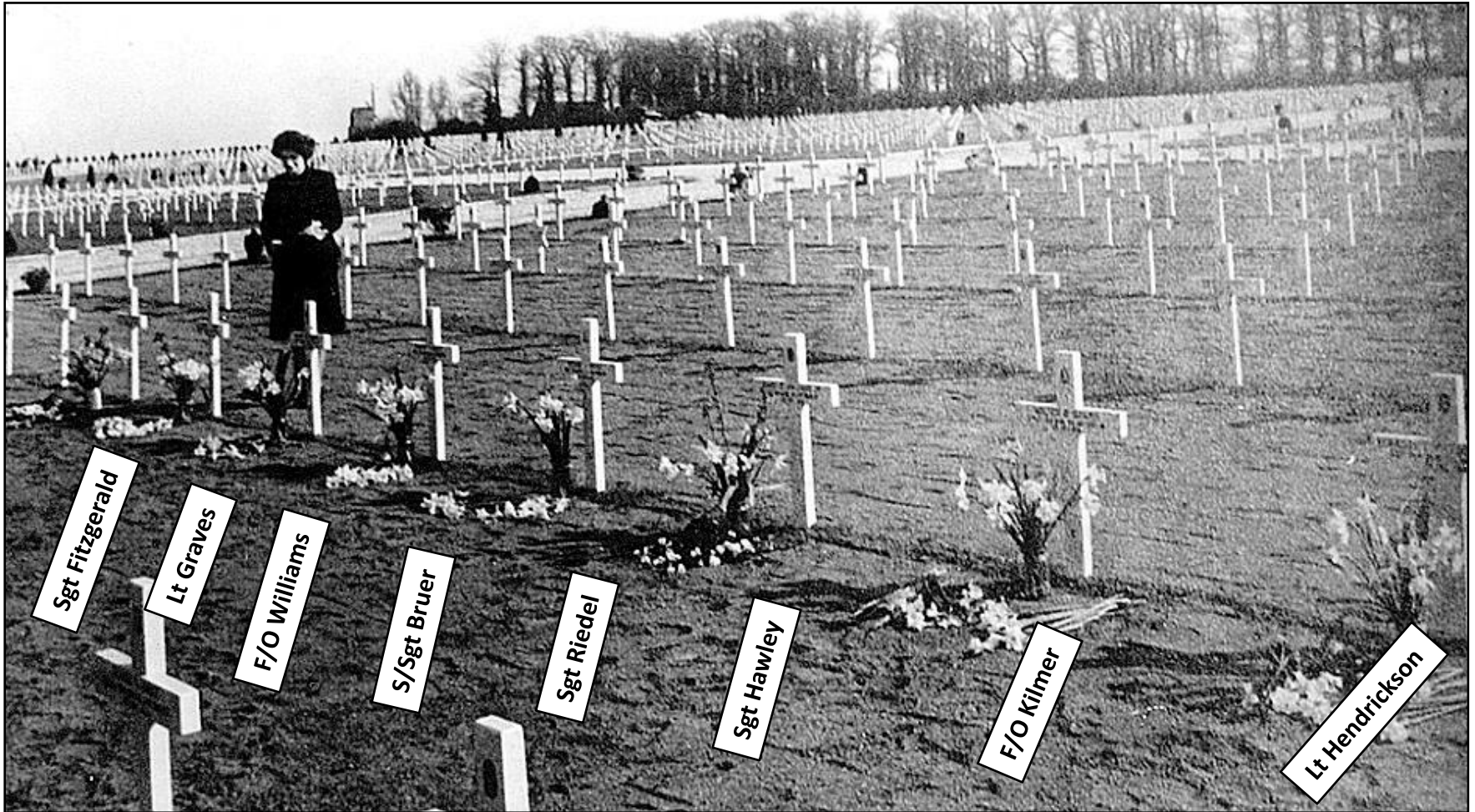
Nursing Sister Lewis laying flowers in 1945.